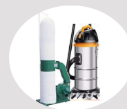
High Volume Vacuum