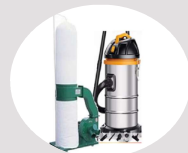
High Volume Vacuum