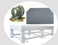
Vacuum & Fixtures

HAPOND DIGITAL TECHNOLOGY SDN. BHD. (788546-V)